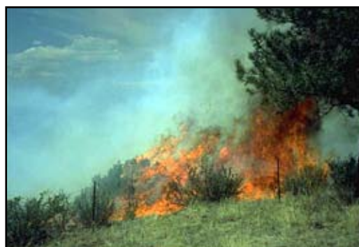
Figure 1. Fire spreads vertically through vegetation (Anchor Point Group, Boulder, CO).