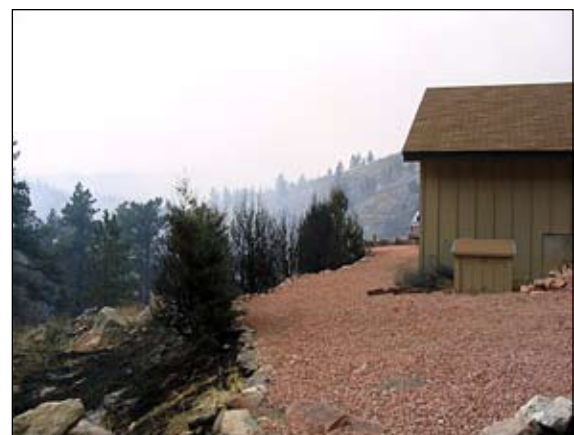
Figure 4. A noncombustible ground cover in Zone 1 helped this home survive a wildfire (Anchor Point Group, Boulder, CO).